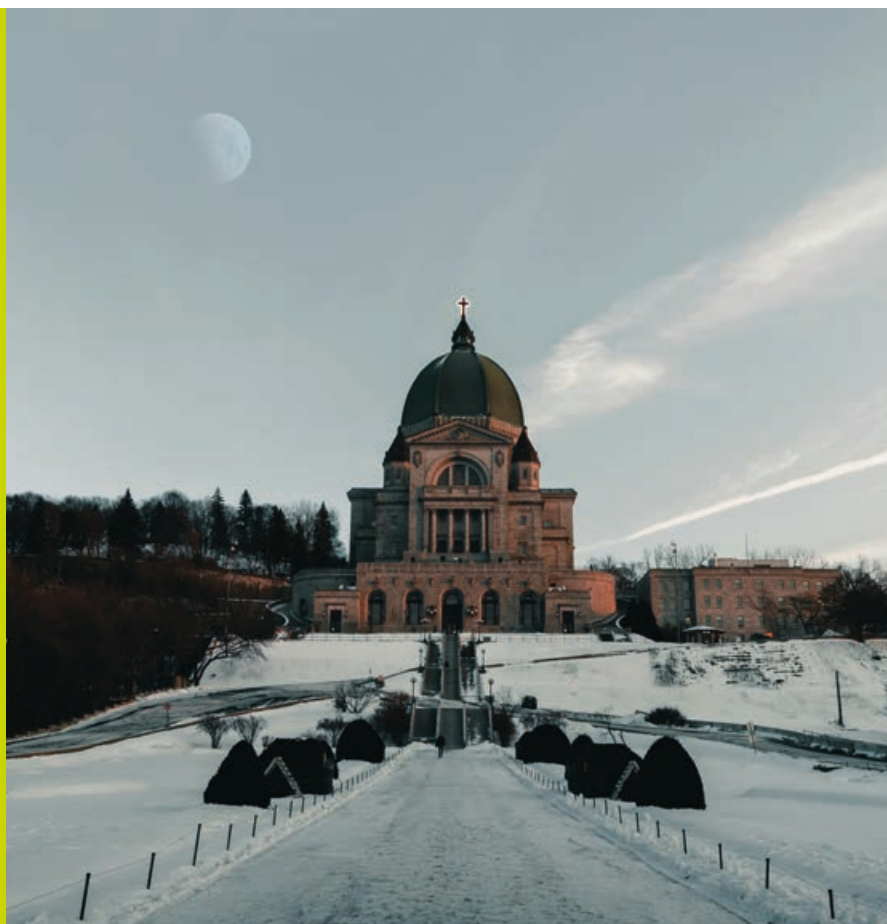
The church of Saint Joseph, on the hill of Mount Royal in Montreal.