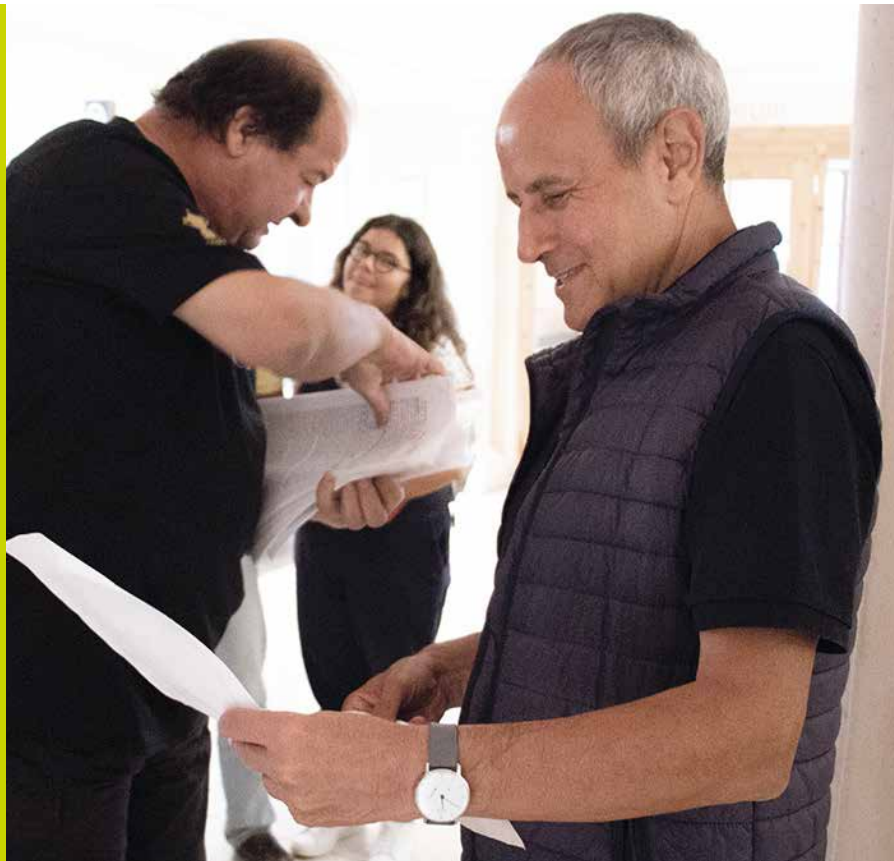
On these pages, some shots taken during the CLU Equipe.