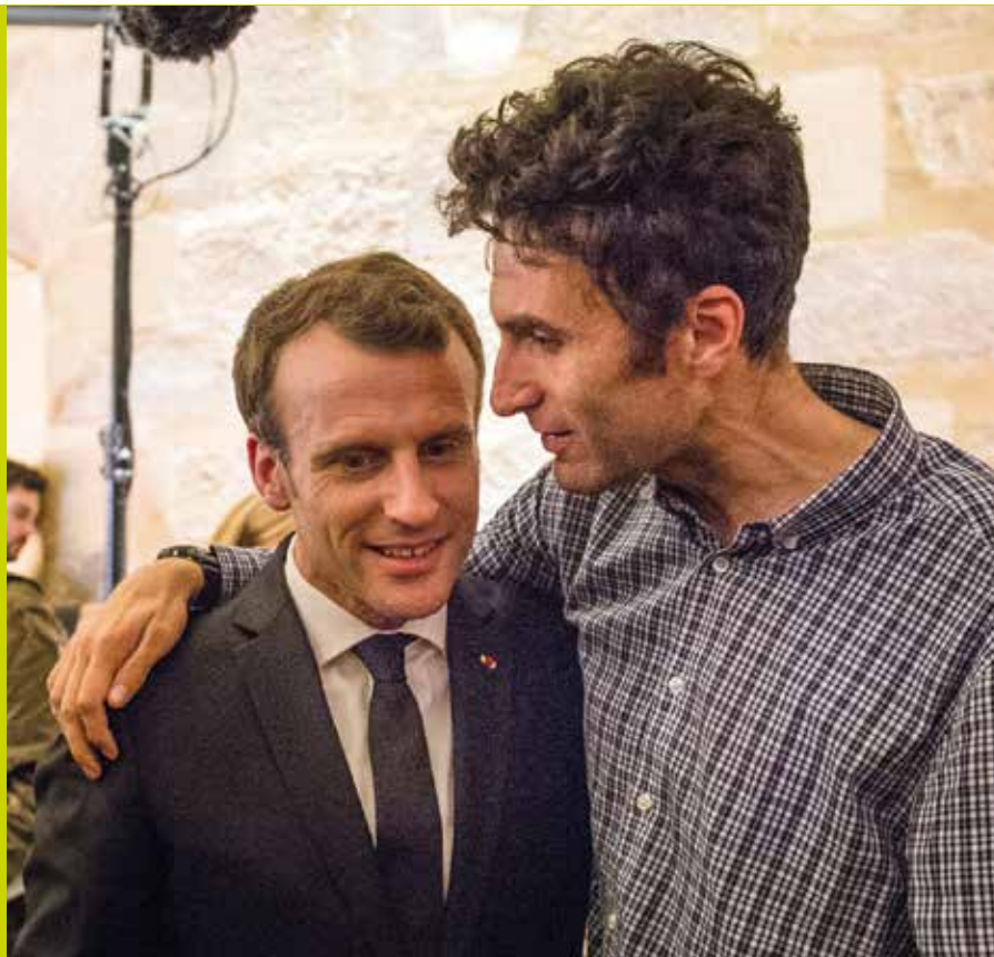
The French President, after his talk at the Collège des Bernardins, greets some members from the community of the Arch of Jean Vanier.

because of this indifference. [...] Today, in this moment of great social fragility, when the very fabric of the nation risks being cut to ribbons, I consider it part of my responsibility not to let the faith of Catholics in their interaction with politics and politicians be eroded. [...] And I cannot permit myself to let this disillusionment get worse. On one side, a part of the political class has undoubtedly exaggerated its attacks on Catholics, for reasons that are too often clearly electoral. [...] We have created a vision of community that is in contradiction to the diversity and vitality of the French Church [...]. On the other side, we have found all the reasons not to listen to Catholics, relegating them, through suspicion and calculation, to a militant minority that wants to undermine our Republican unanimity. [...]