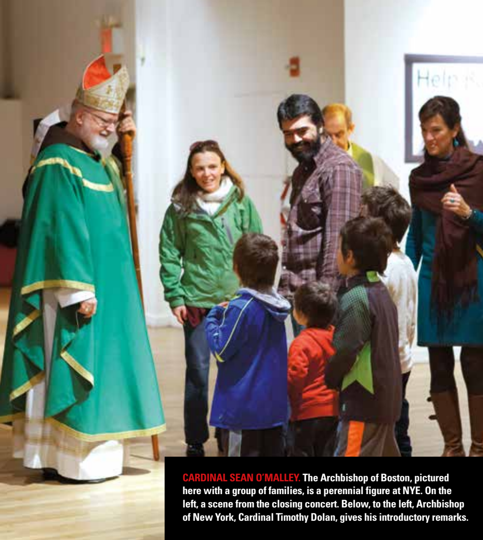
CARDINAL SEAN O'MALLEY. The Archbishop of Boston, pictured here with a group of families, is a perennial figure at NYE. On the left, a scene from the closing concert. Below, to the left, Archbishop of New York, Cardinal Timothy Dolan, gives his introductory remarks.