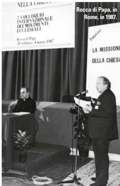
Rocca di Papa, in Rome, in 1987.

EVEN THE “FARTHEST AWAY.” I am always struck by observing how the charism and thought of Fr. Giussani goes beyond the visible borders of Communion and Liberation, spreads along unexpected roads, illuminates the Christian life of many, and also evokes questions, reflections, and ex-