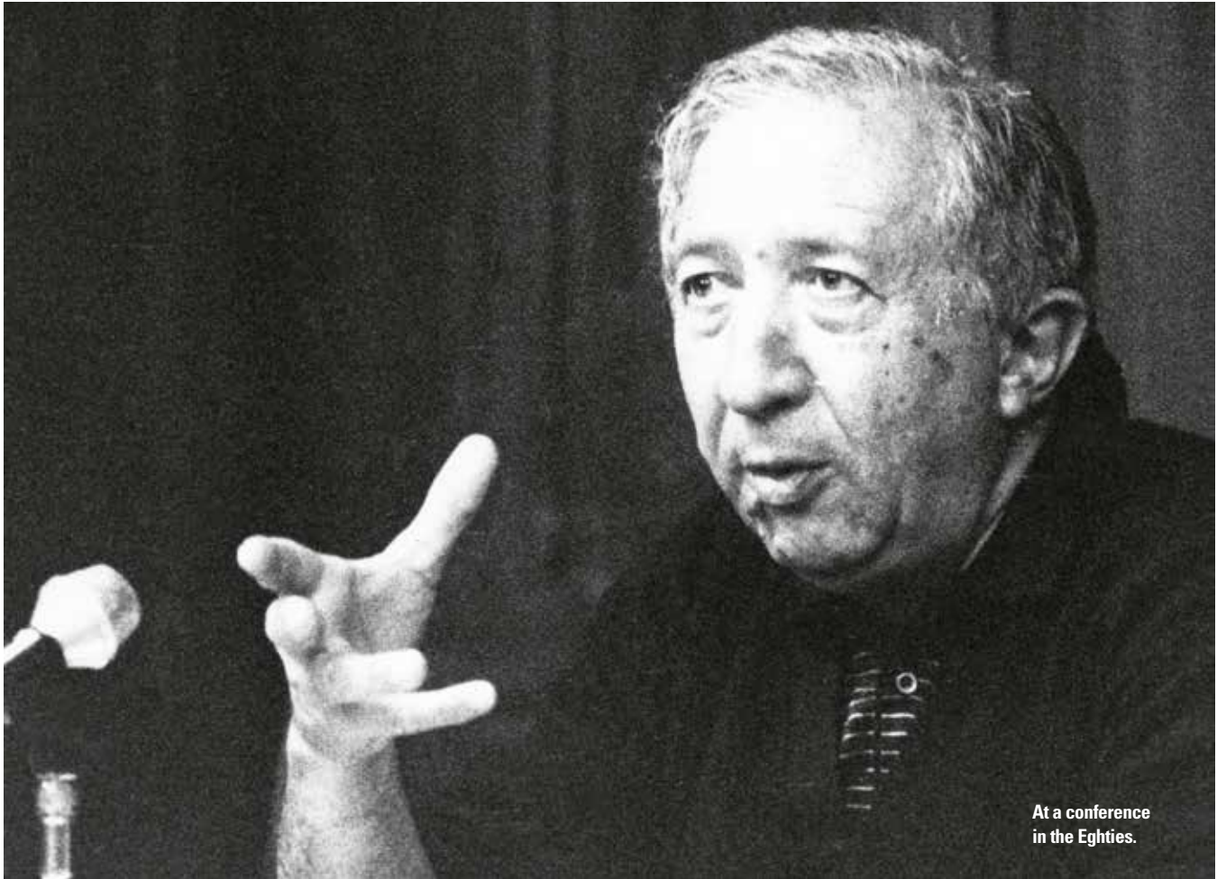
At a conference in the Eighties.

Ratzinger became the most “Giussanian” Pope, underlining their profound similarities in proposing the great Catholic tradition to people of our times in a new way. And how can I not recall when Jorge Mario Bergoglio, who is not one for protocol or formal