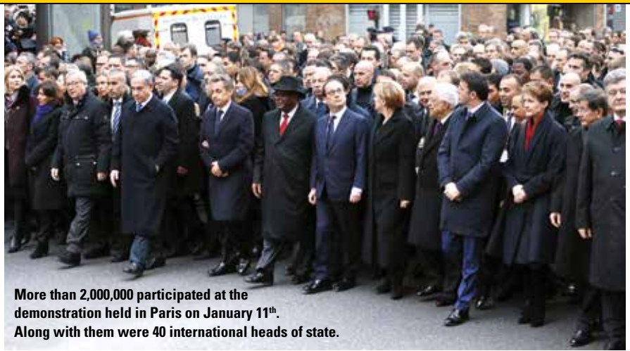
More than 2,000,000 participated at the demonstration held in Paris on January 11 th . Along with them were 40 international heads of state.

Jürgen Habermas attributes all of this to the exclusion of religion from the public sphere. Indeed, all the social challenges that we find ourselves having to face can be traced back to the fundamental incapacity to find meaning in life, and religion is a primary source of meaning. Postmodernists claim to have freed humanity from the prison of polarities (such as good and evil, presence and absence, I and other), but the truth is that we've gone from seeing each set of polarities as opposites to actually equating them, resulting in the incapacity to form a judgment. From this flows a break in any authentic interaction with reality and the collapse